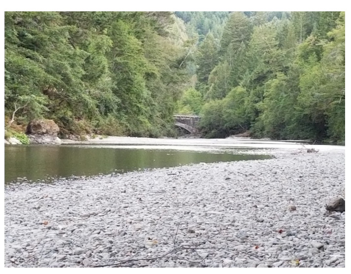
In the distance, the concrete bridge hidden in the meanderings of the Mattole River.

Up river from the bridge there is what was called the Mill Pond, which is actually the start of the camp's swimming hole. Sam Kelsey had a timber mill here and used this