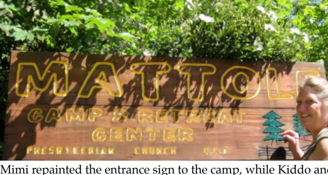
Mimi repainted the entrance sign to the camp, while Kiddo and Rusty did what all good dogs do... Absolutely NUTHIN!